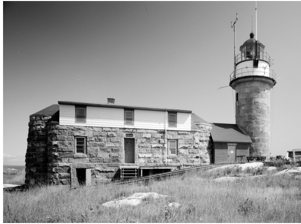
Matinicus Rock Light Station